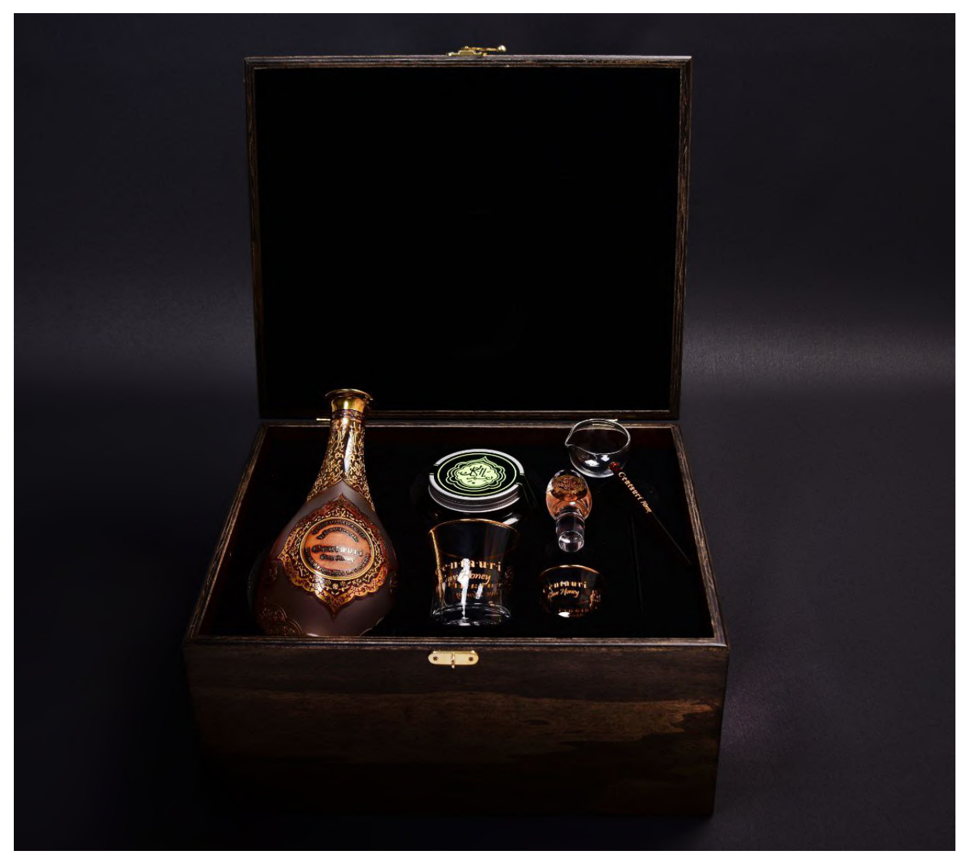
Centauri Honey is available in individual jars as well as in luxurious gift boxes for VIP customers, which feature lavish partially gold-plated serving bottles

This type of honey can't be produced overnight, and clients must be prepared to wait between three and 12 months for their order to be ready – but by all accounts, it's worth the wait.