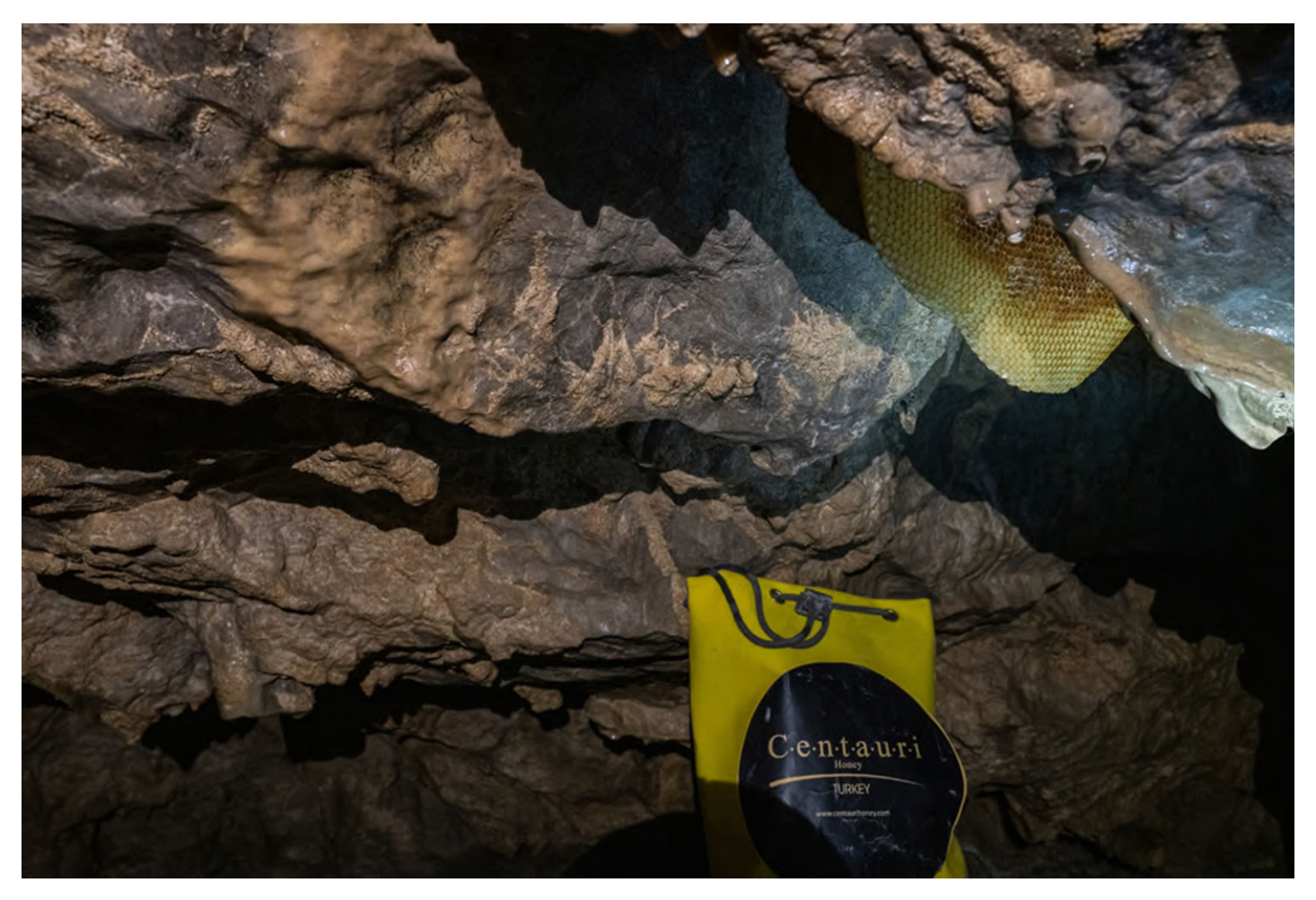
The honey is carefully extracted from the depths of caves, ranging from ten to a staggering 500 metres below the earth's surface

The bee colonies that produce this extraordinary honey are nurtured with a special mixture to ensure the bees themselves enjoy optimal health and that production remains consistent – because, after all, what they provide is rather precious. They are treated with the utmost respect at every stage, too – because, quite simply, they deserve it.